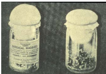
Surgical Maggots - Lederle. From a 1934 JAMA advertisement

Attendees will learn how, when, and why to use maggot debridement therapy effectively for their patients with non-healing wounds. Participants will have the opportunity to practice applying maggot dressings on mock patients, will learn what other dressing materials work well with maggot dressings, and learn how maggot debridement therapy (MDT) can be integrated successfully as an adjunct to conventional wound care. Attendees can also take a tour of the Medical Maggot production facility. Sorry, CMEs/CEUs are not available for this workshop.